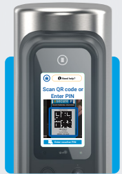
Select "Enter voucher PIN" at bottom of screen