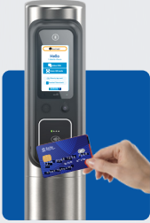
Tap your payment card