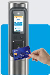
Tap your same payment card used at entry