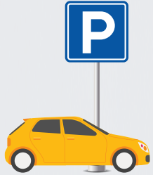
Park your car