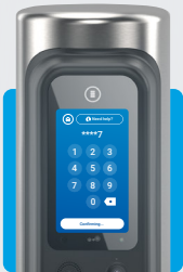
Enter your voucher PIN and press "Confirm"