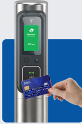
Wait for welcome screen and gate will open